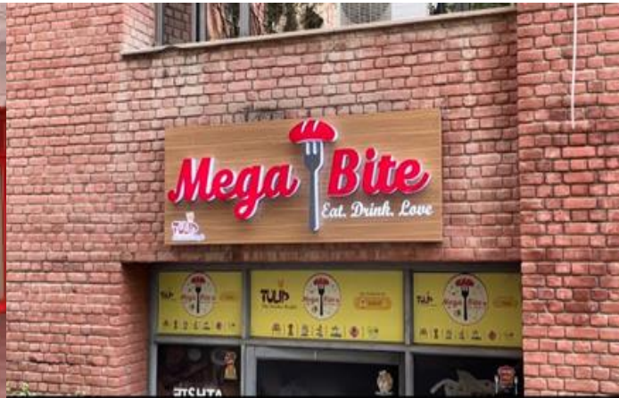
MEGA BITE( Manjap Foods)